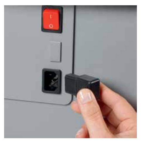
shredder quick and easy to move from A to B