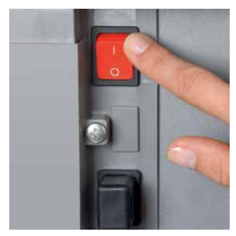
Separate main switch is located on the rear of the Detachable IEC power plug makes the document Pull-out rounded top frame that's kind on the document shredder and completely disconnects it from the mains power supply