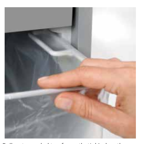
fingers when changing the waste bag