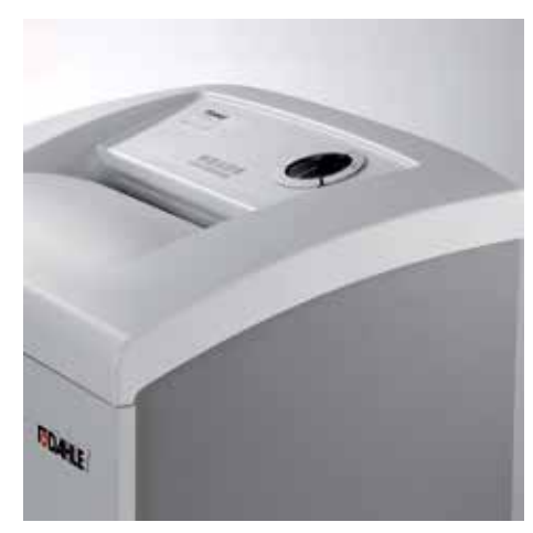
Modern design blends into any working environment.