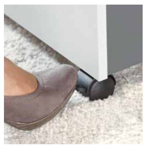
Convenient swivel casters providing 5 cm floor clearance for greater mobility and two brakes for reliably keeping the shredder firmly in place at the point of use