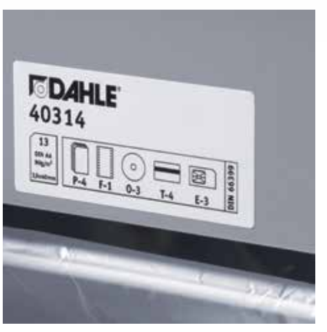
Clearly labelled performance characteristics on the top of the shredder help to ensure correct document shredder operation