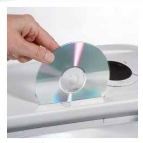
Separate feed opening for CDs, DVDs, cheque and credit cards guarantees reliable shredding of optical, magnetic and/or electronic data carriers