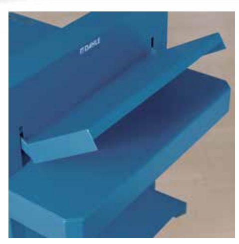
Sturdy blade cover guards in metal on heavy-duty cutter 842 cover the entire work area while cutting