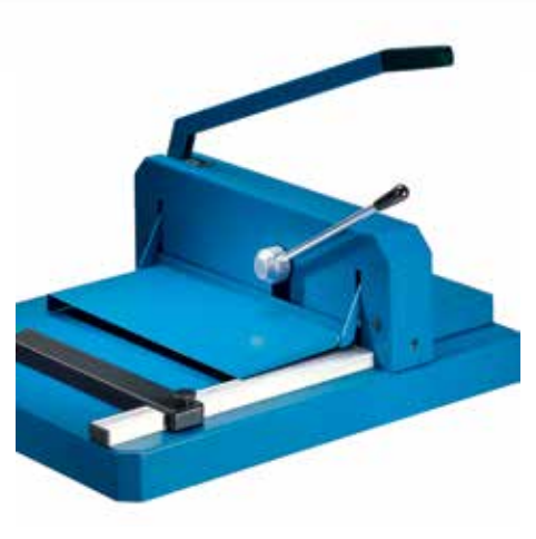
Heavy-duty guillotine 842 also available as desk-top model