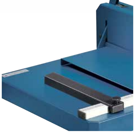
Adjustable metal backstop for quickly finding the right format