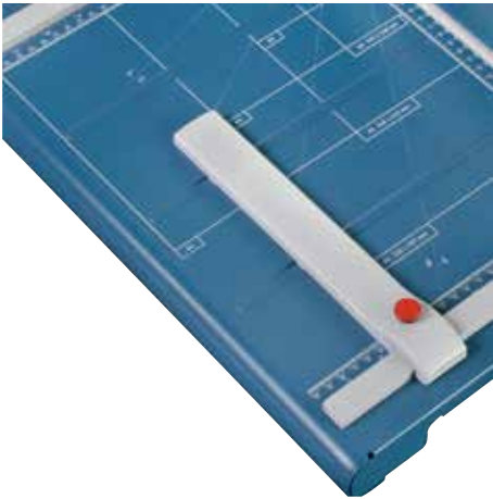
Adjustable backstop for quickly finding the right format can be used on both scale bars