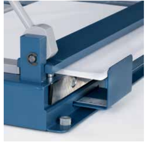
Powerful performance from Dahle model 564 for cutting up to 50 sheets