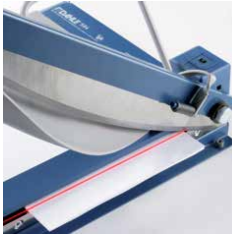
Precision laser beam line indication provides professional cutting results