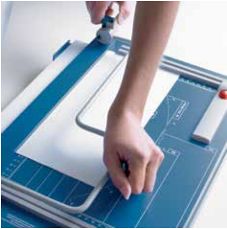
Manual D-bar clamp for holding item being cut perfectly in place