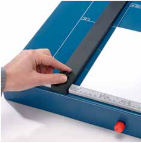
Adjustable, screw-fastening backstop in metal for quickly finding the right format can be used on both scale bars