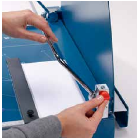
Stay-down D-bar clamp ensures item being cut is held perfectly in place