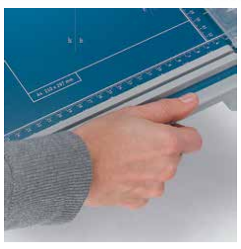
Practical recessed grips for safe and easy handling