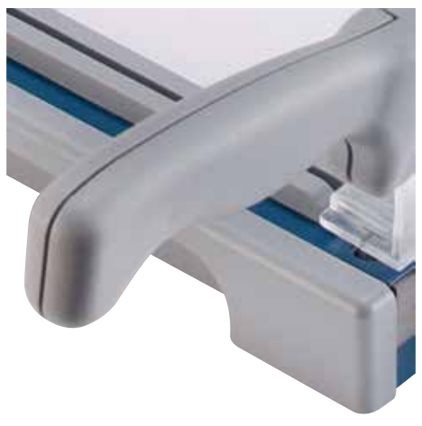
Ergonomically shaped handle to prevent tired hands while cutting