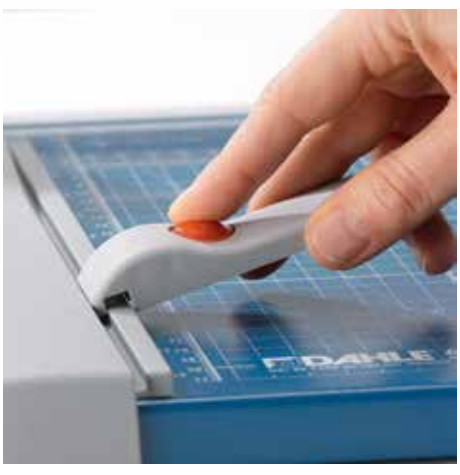
Adjustable backstop for quickly finding the right format can be used on both scale bars