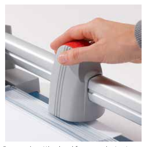
Ergonomic cutting head for convenient cutting-machine operation