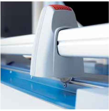
Circular blade in the sealed plastic housing provides maximum safety